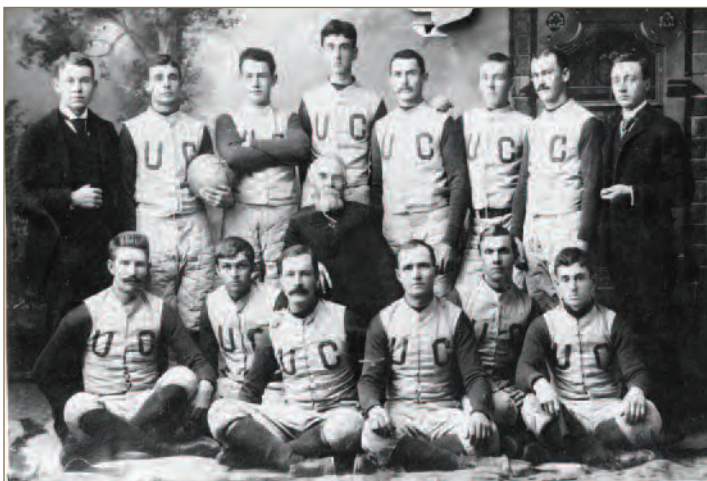
The 1891 team that recorded CU's first win